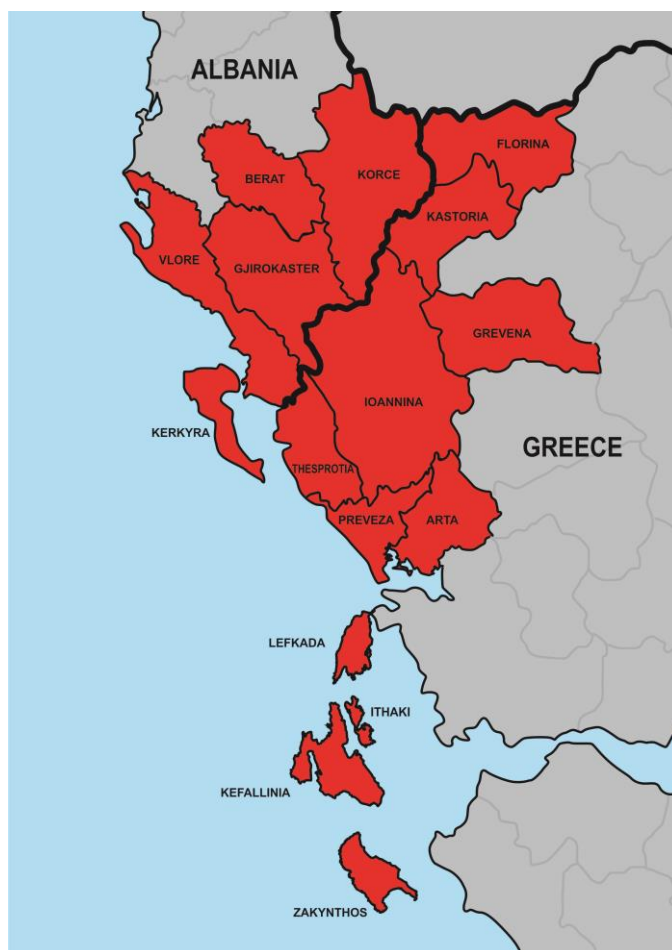
Map 1: Greece-Albania 2014 – 2020 eligible area

The Programme cross- border eligible area is illustrated on the map below: